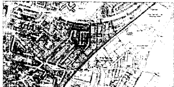
Site 353: Chessington Industrial Estate, Kingston