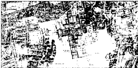
Site 102: Purley Way, Lysander Road and Imperial Way Industrial Area, Croydon