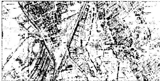
Site 642: Dumsford Road Industrial Area, Merton